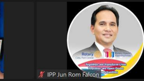
IPP Jun Rom Falcon